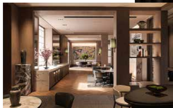
Above: Capella Sydney spans a city block. Left: its public Living Room will showcase artefacts and art. Opposite: the iconic facade of the Old War Office.