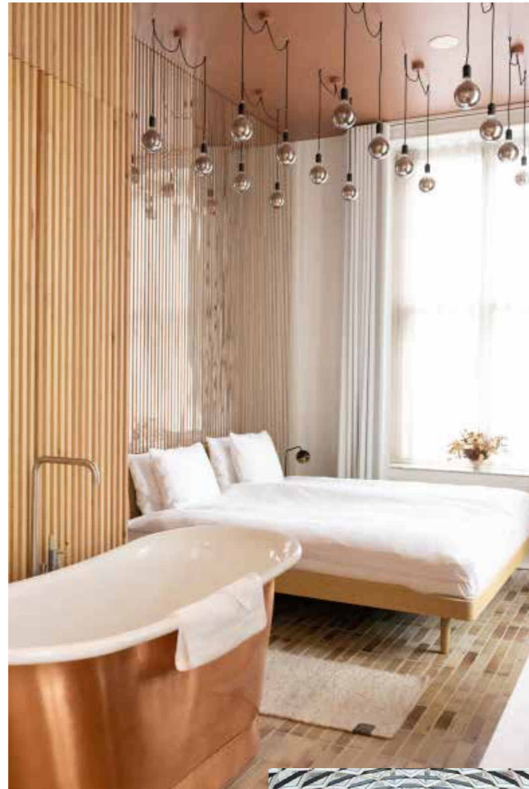
From top: Villa Copenhagen's Earth Suite features sustainable elements from bricks to bedlinen; Courtyard Bar, designed by Shamballa Jewels. Opposite: the heritage post office facade.